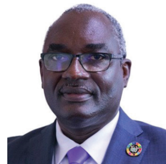
Professor George Gyan-Baffour Chairman, NDPC

In recent times, there has been an awakening call for regional and local governments to also review the state of implementation of the SDGs in their respective jurisdictions. In view of this, the New York City launched a Voluntary Local Review (VLR) Declaration in September 2019 to signal the need for local and regional governments world wide to formally commit to reporting on the SDGs. This alongside the localisation of the 2030 Agenda is aimed at bringing the SDGs closer to the people they serve and using the framework as a tool for planning. The Accra Metropolitan Assembly was the first local authority to prepare a Voluntary Local Review in Ghana. This has fueled interest among other Metropolitan, Municipal and District Assemblies (MMDAs) in Ghana to prepare their Voluntary Local Reviews.