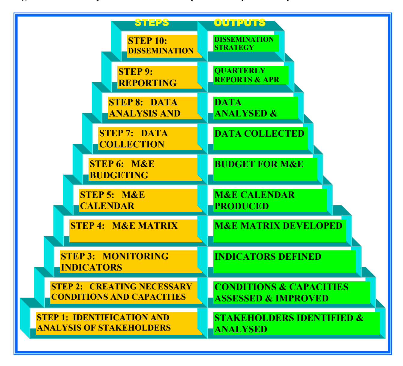
Figure 3.2: Summary of the M&E Plan Preparation Steps and Outputs