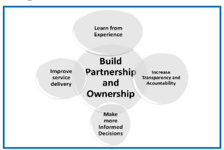
Figure 1.1 M&E Pillars

government can do more with less. Civil society, parliament and other stakeholders are also putting accountability pressures on government to publicly report on performances. This is particularly true in Ghana, where government itself has promised to deliver on public sector transparency and accountability. As a result, Government has taken purposive steps to establish and progressively refine the M&E systems in support of its core functions. M&E in the country has therefore shifted from being implementation based (concerned with the implementation of activities) to being results-based (assessing if real changes have occurred).