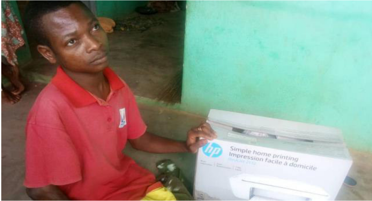
Figure 18: Distribution of equipment to PWD