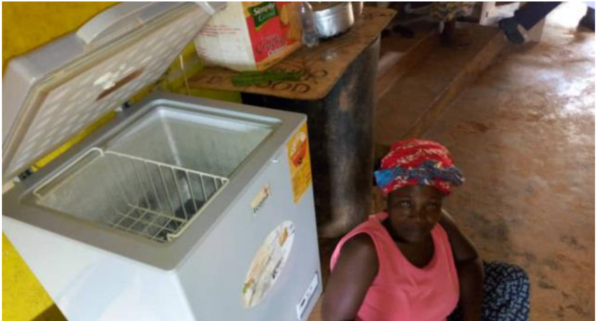
Figure 16: Fridges Distribution to PWD