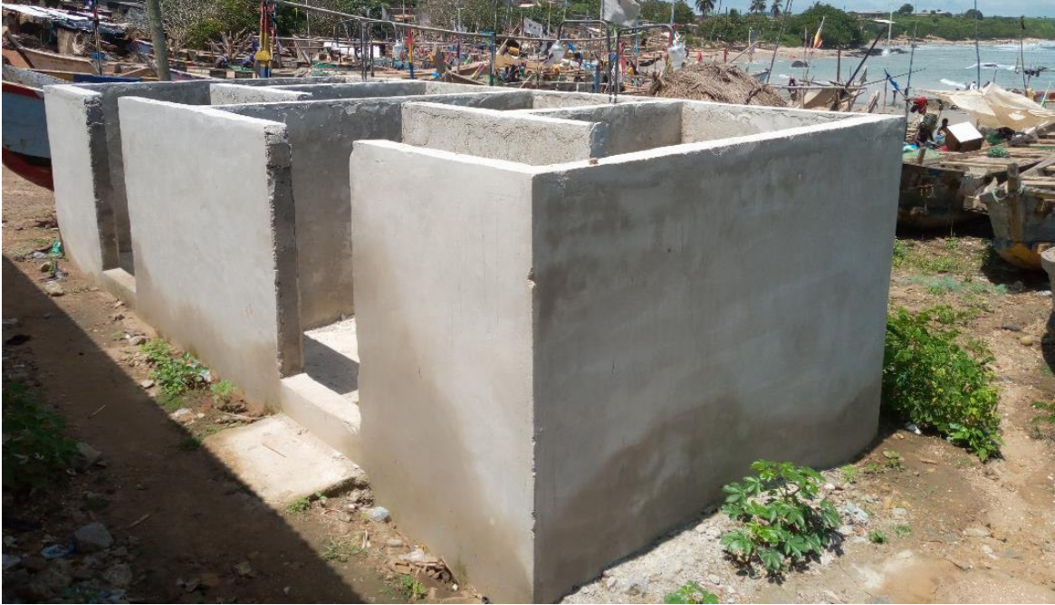
Figure 28: Community bath centre at Gomoa Dago with Premix Fuel Proceed

Construction of classroom blocks in the following communities;