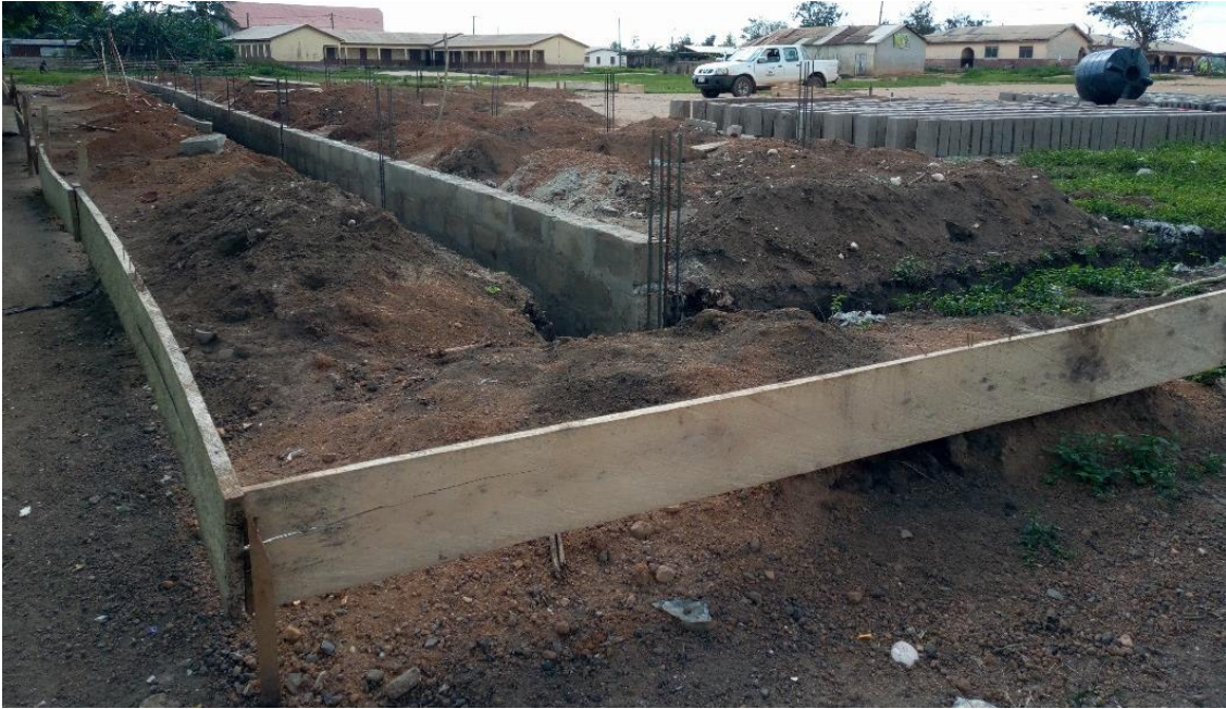
Figure 26: Community Centre under construction at Gomoa Eshiem