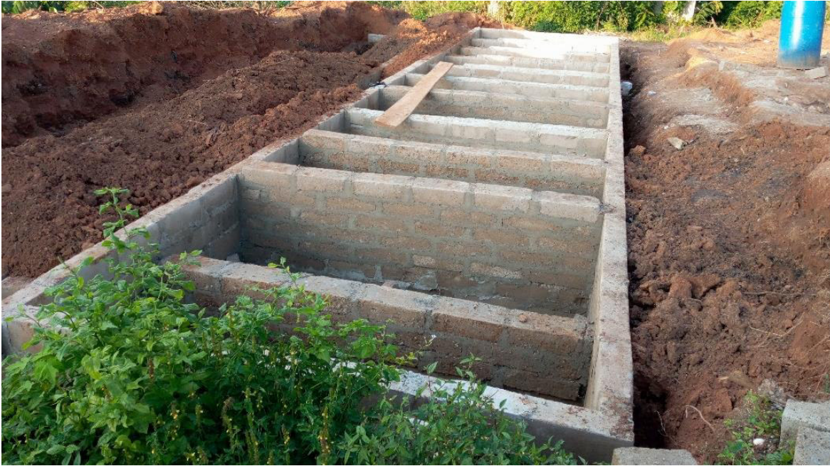
Figure 14: 10-seater KVIP at Gomoa Adaa – 25% completed