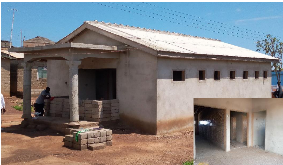
Figure 13: On-going 1no. 12-seater WC at Mumford with Premix Fuel Proceed