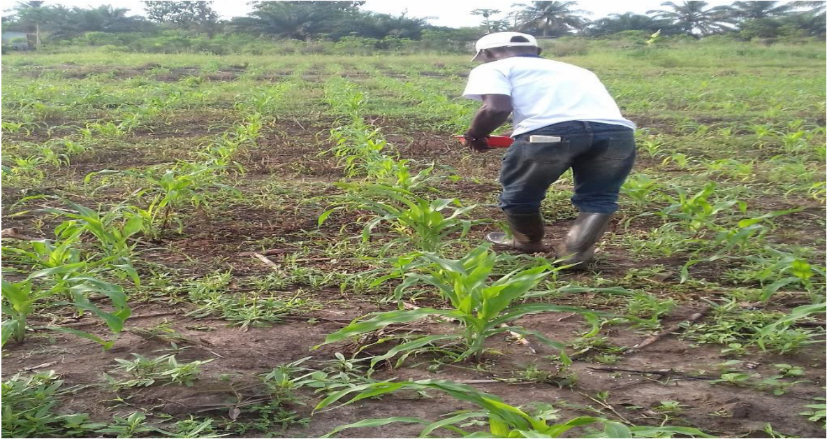
Figure 46: Rasheed Dayman demonstrating fertilizer application during a field day at Ankamu