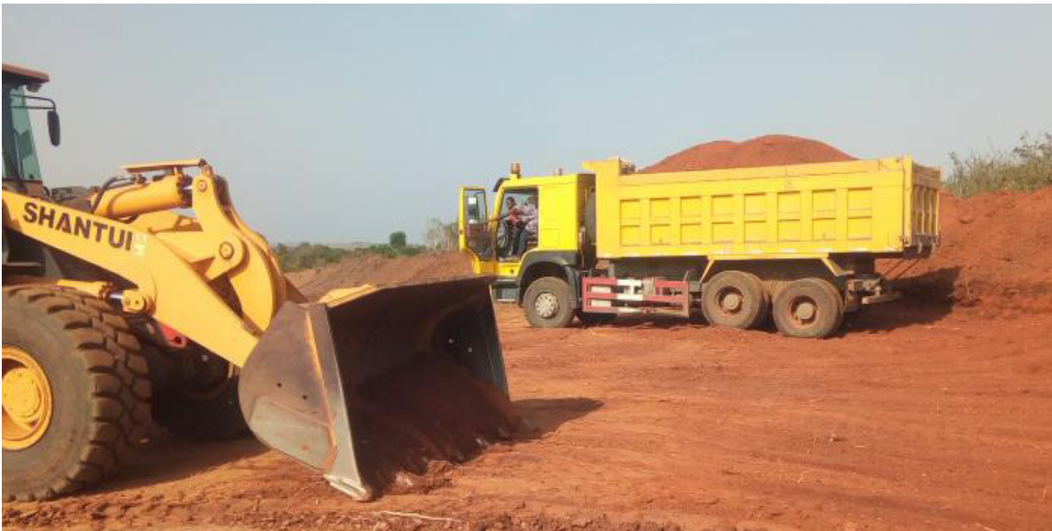
Figure 15: New Refuse disposal site at Apam