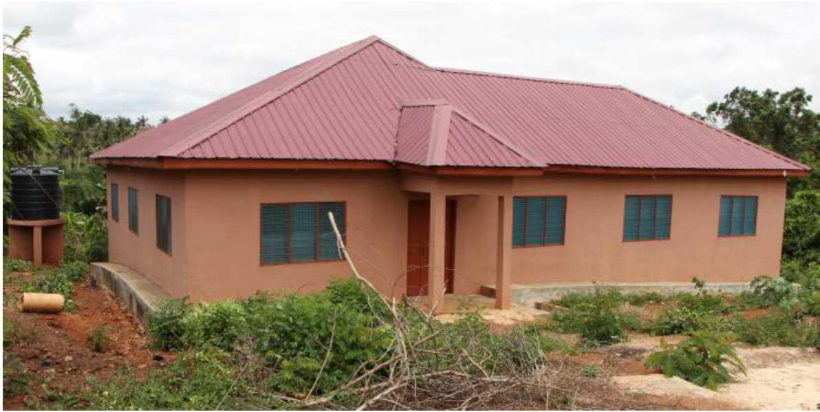
Figure 3: CHPS Compound at Gomoa Enyeme – 100% completed