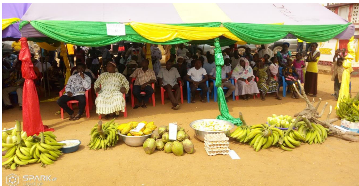
Figure 63: Some exhibits during the celebrations