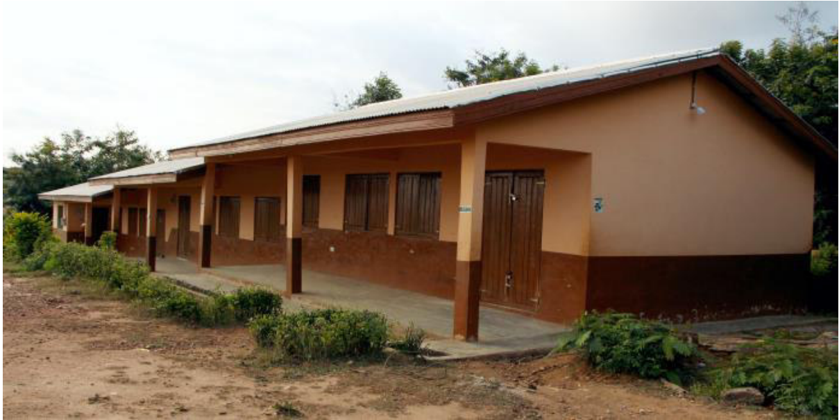
Figure 34: 1no. 3-unit classroom block at Gomoa Hwida