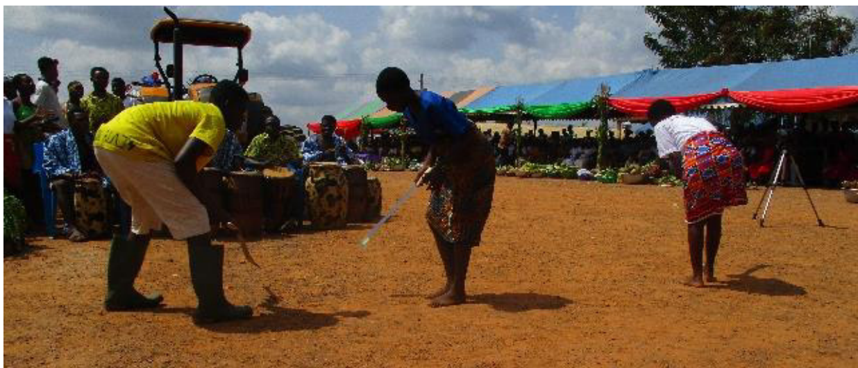
Figure 66: The drama troops display their performance during the farmer's day