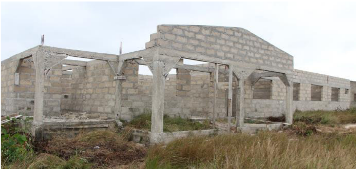
Figure 8: Ino. CHPS Compound at Apam financed with Premix Fuel proceed