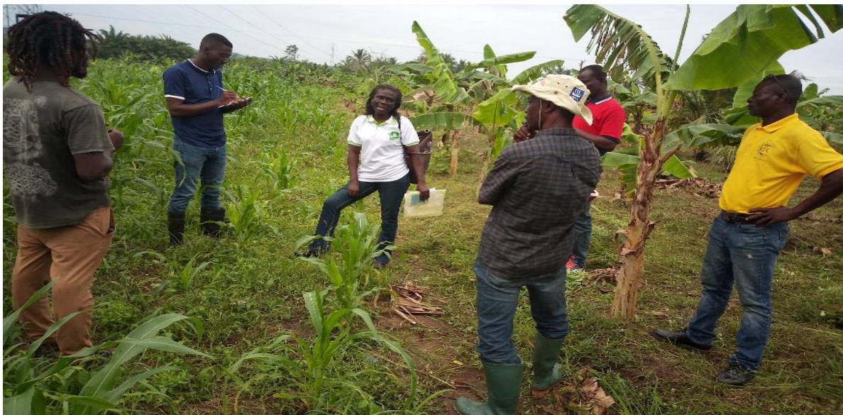
Figure 53: Collaboration with Mephiboseth Training Centre