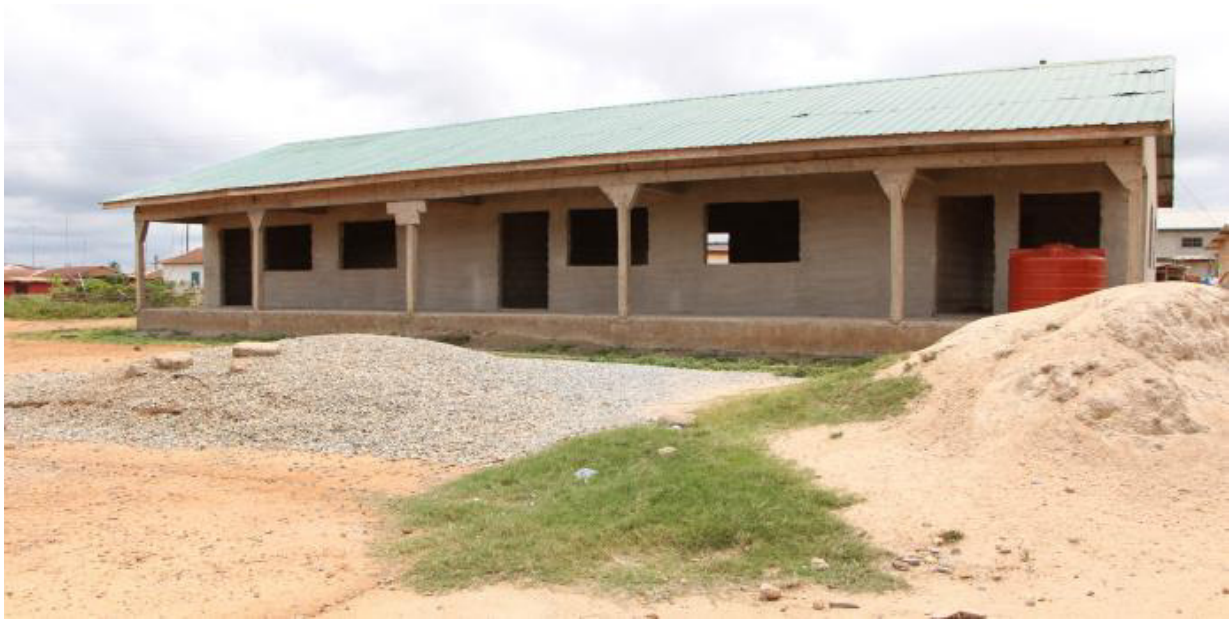
Figure 35: 1no. 2-unit KG block at Gomoa Dawurampong