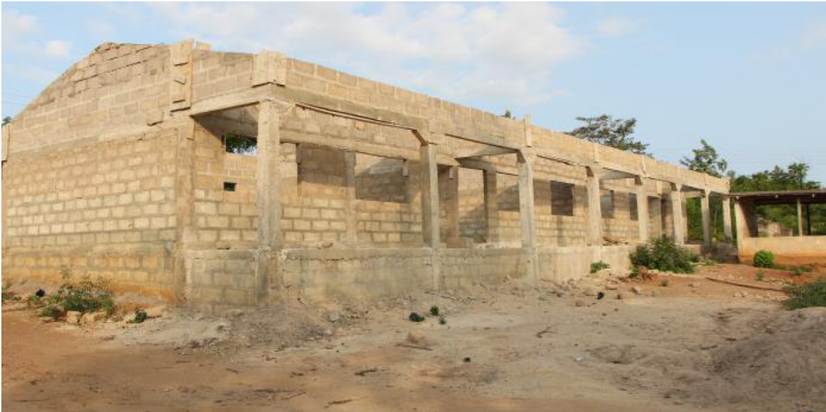
Figure 31: 3-unit classroom at Gomoa Obiri