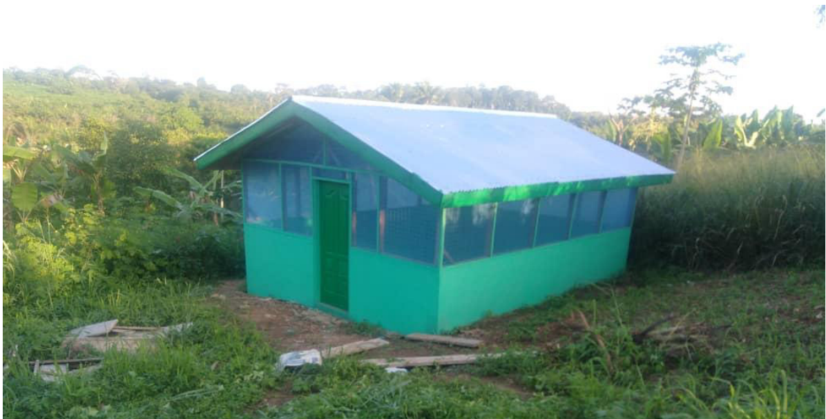
Figure 20: Start up kit Poultry at Gomoa Dawurampong