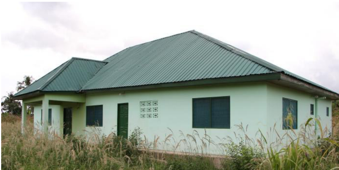
Figure 4: Ino. CHPS at Gomoa Appiakrom Debiso