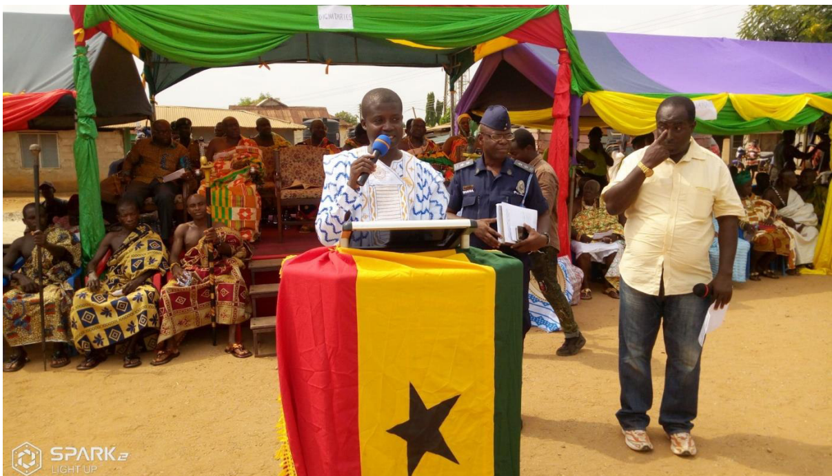
Figure 62: The DCE giving his address