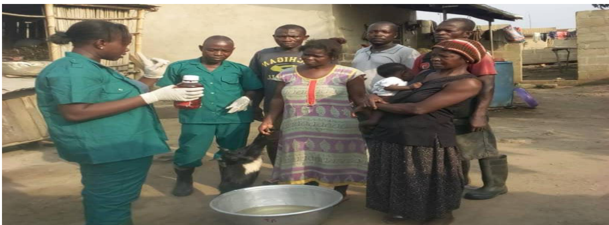
Figure 56: AEA for Assin administering a drug