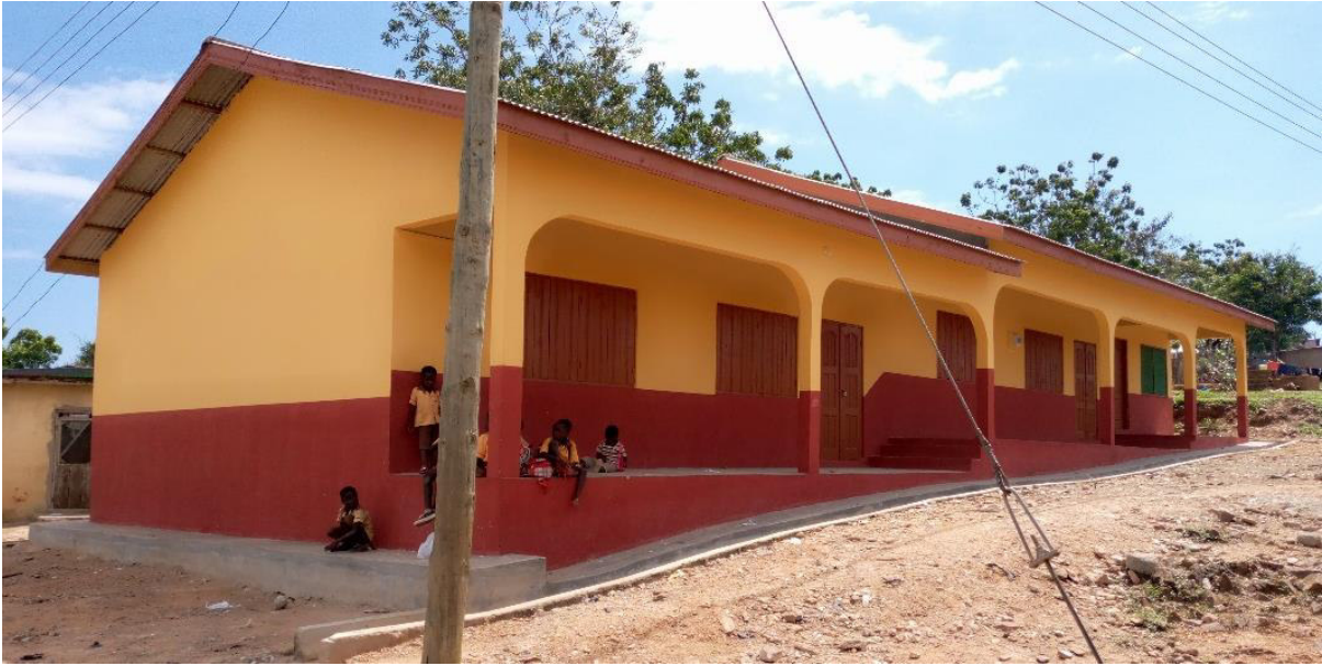
Figure 32: 1no. 2-unit KG block at Gomoa Akyemfo – practically completed