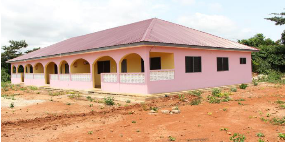
Figure 36: 1no 3-unit Teachers' Quarters at Gomoa Darmang – 100% completed