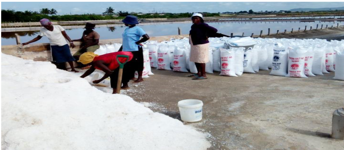
Figure 64: Universal Salt Iodization Activities