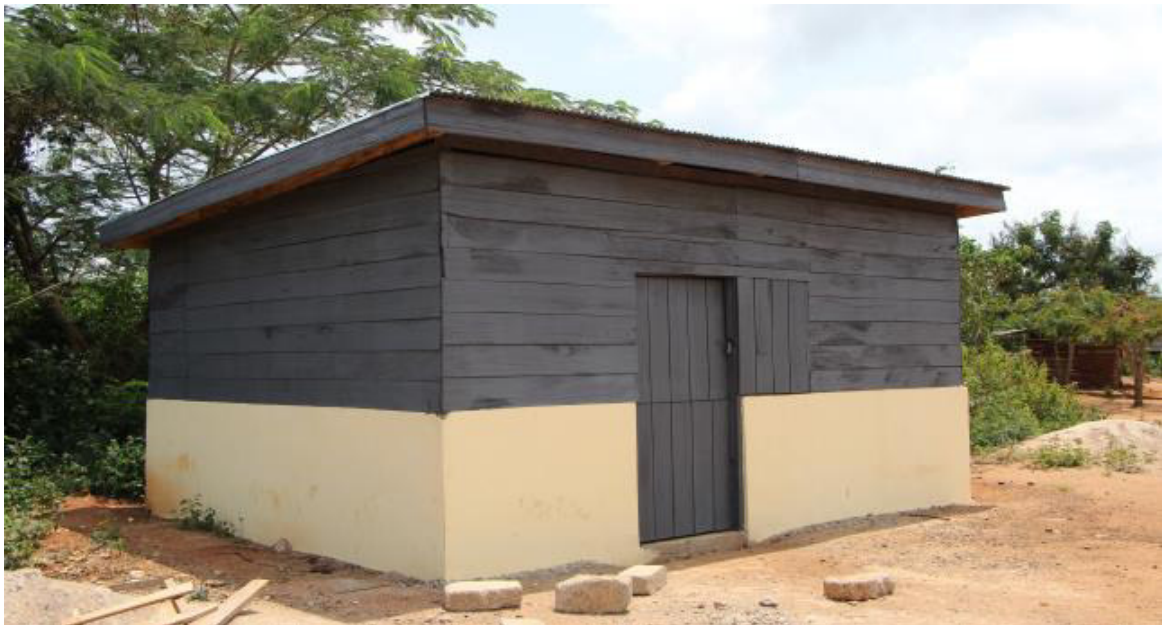
Figure 17: Cornmill at Darmang for PWD