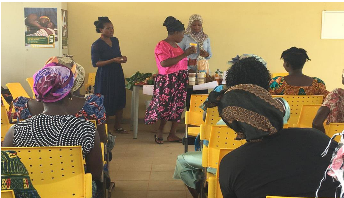
Figure 45: WIAD Training at Dawurampong