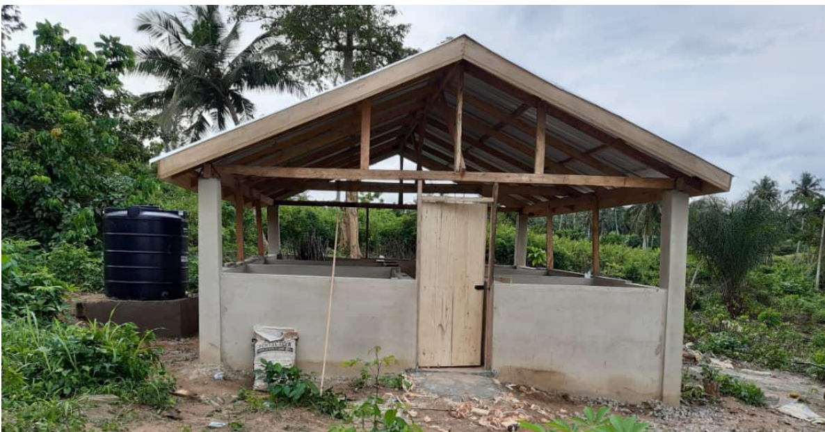
Figure 24: Start up kit for goats and sheep at Gomoa Eshiem