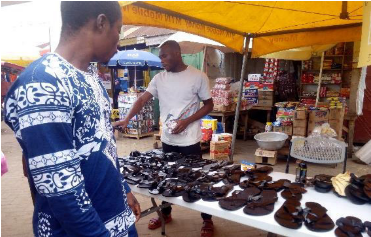
Figure 65: Some of participant exhibitors exhibits their various products