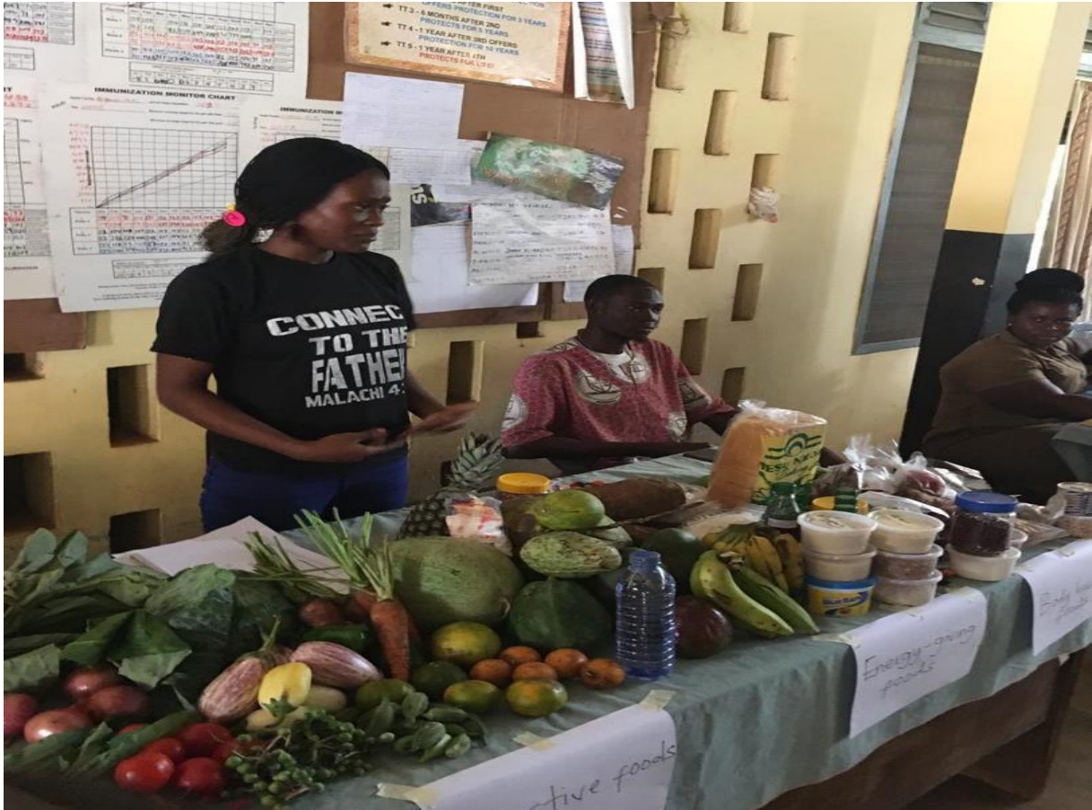
Figure 44: Display table of a WIAD training at Oguaa