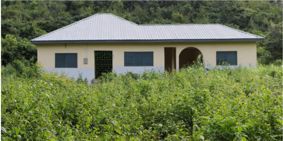
Figure 5: Ino. CHPS Compound at Gomoa Obiri