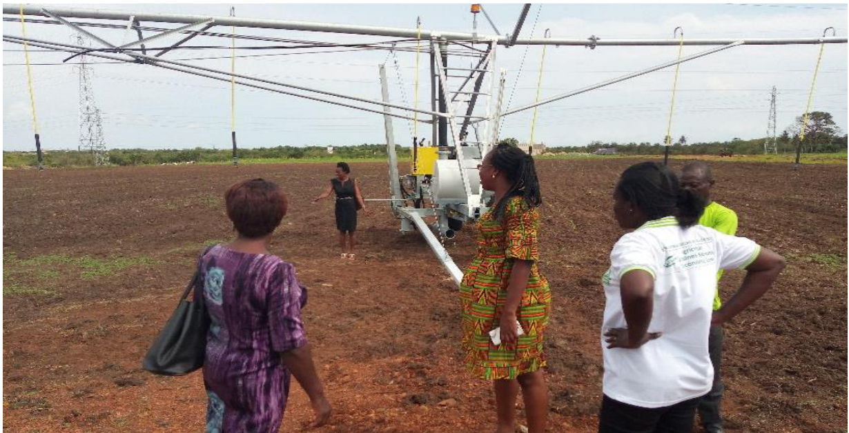
Figure 51: Working visit of the Regional WIAD Officer to CASA DE ROPA