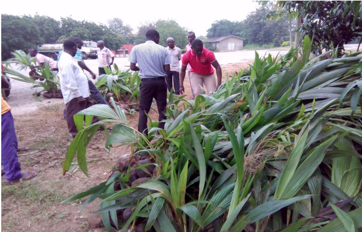
Figure 59: Coconut seedling distribution under PERD