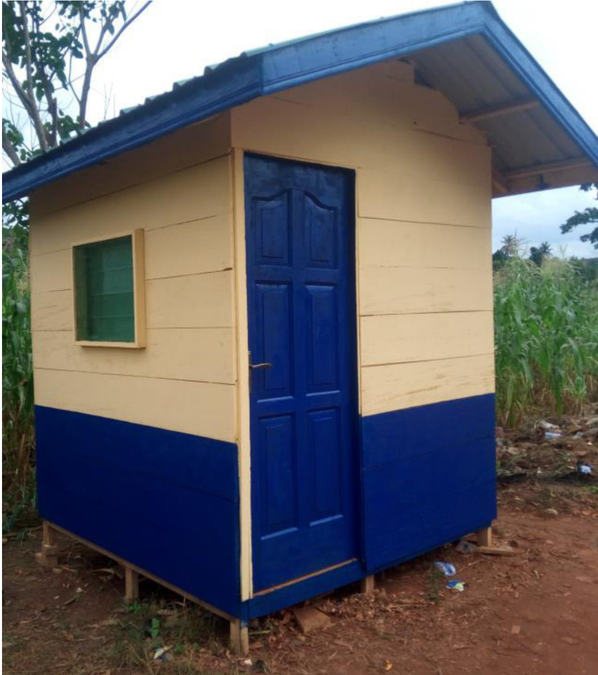
Figure 25: One of the three security posts at Gomoa Antseadze