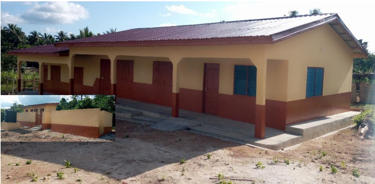
Figure 33: 1no. 2-unit KG block at Gomoa Akyempim – practically completed