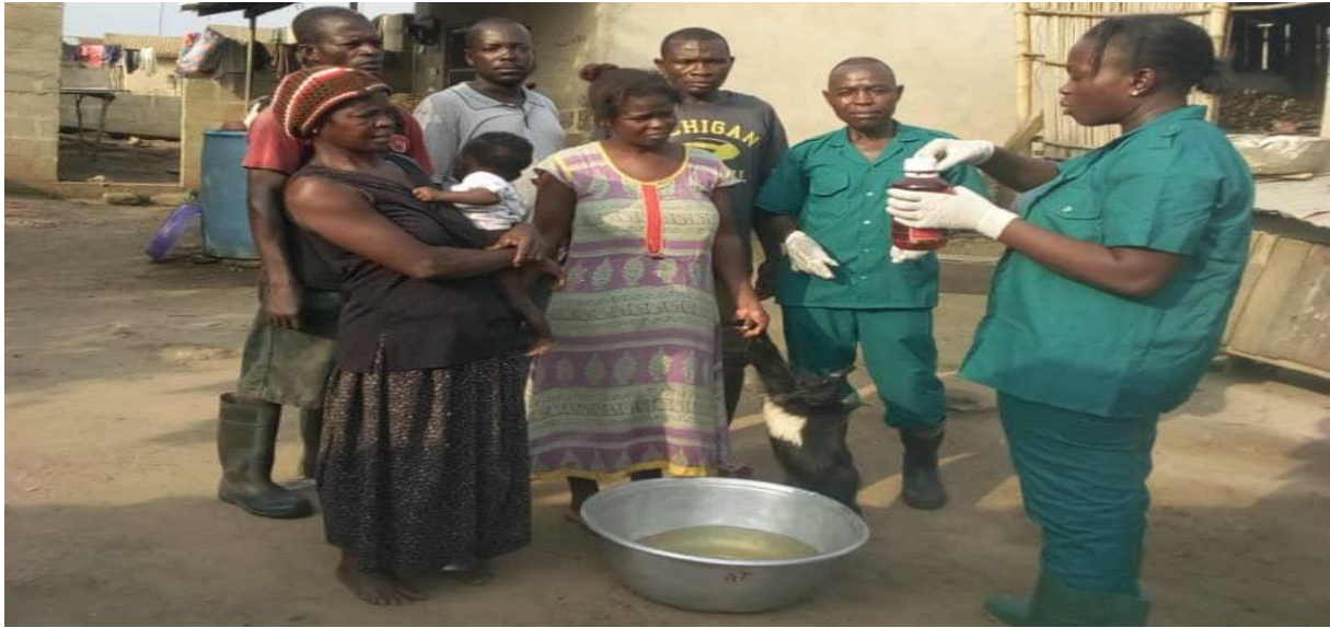
Figure 54: VET AEA together with the AEA for Assin treating some livestock at Assin