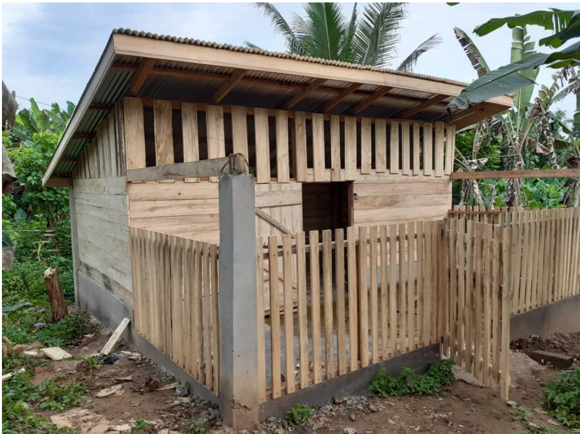
Figure 22: Start up kit for goats and sheep at Gomoa Eshiem