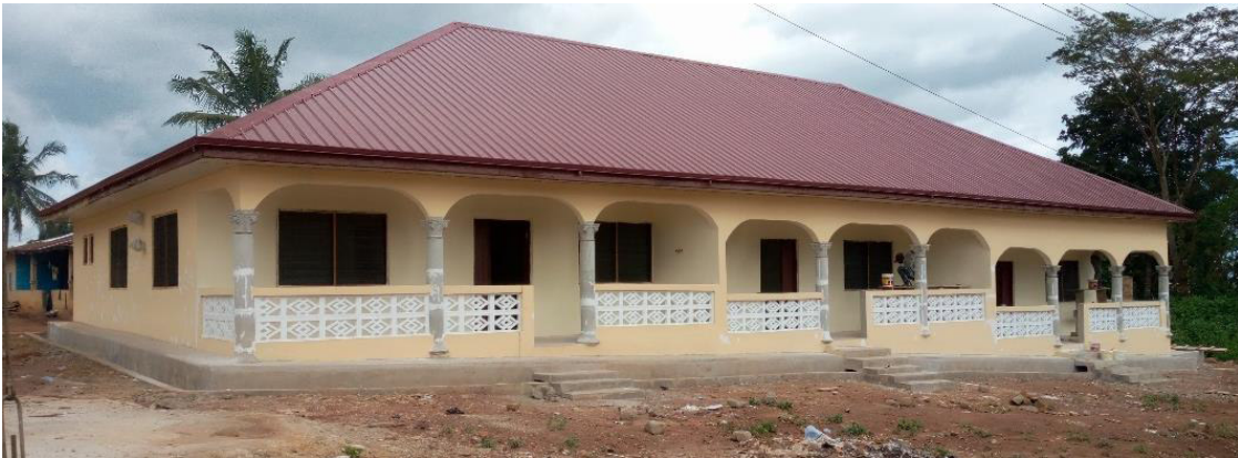
Figure 37: 1no 3-unit Teachers' Quarters at Gomoa Abonko – 95% completed