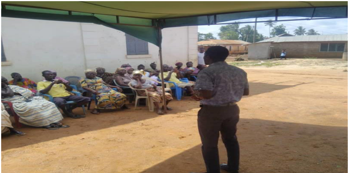
Figure 55: The MIS Officer giving a talk at Oguaa during a farmers fora