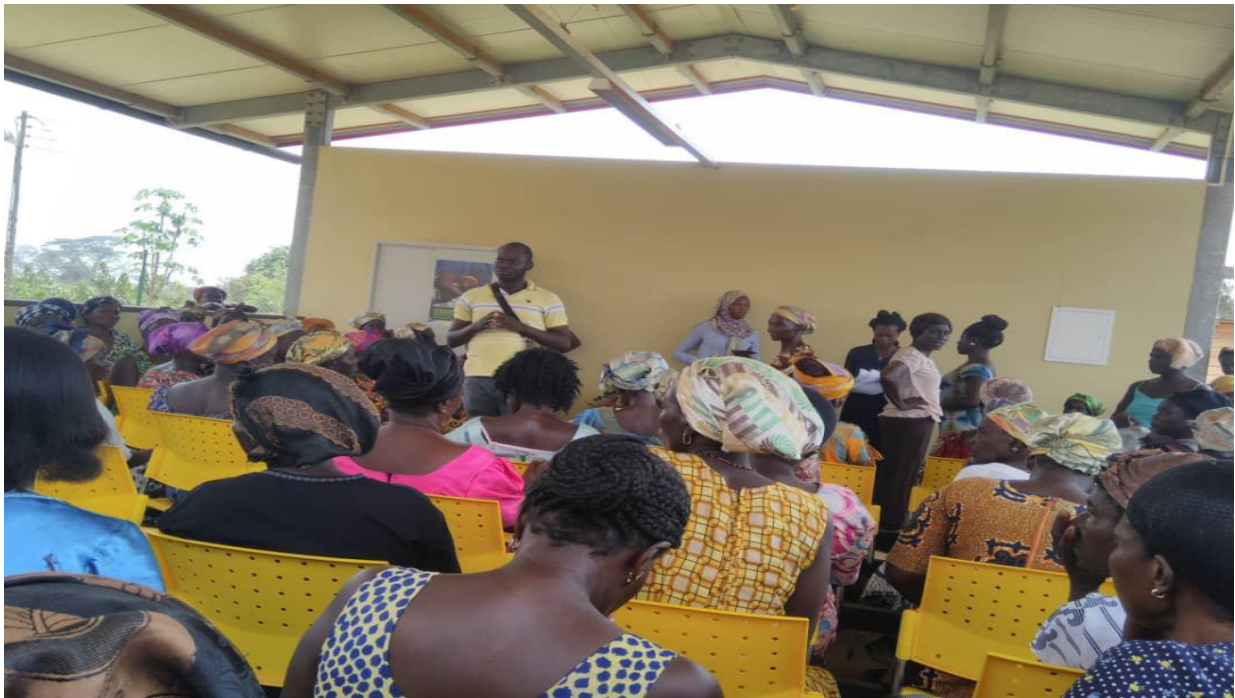
Figure 42: Cross section of participants from a WIAD training at Dawuramong