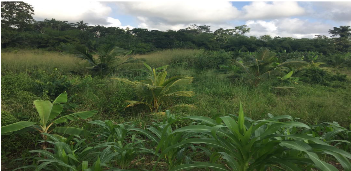
Figure 58: Some of the established coconut seedlings under PERD