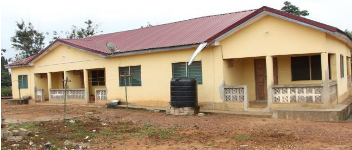
Figure 38: 1no 3-unit Teachers' Quarters at Gomoa Brofo – inherited at 80% but now completed and in use