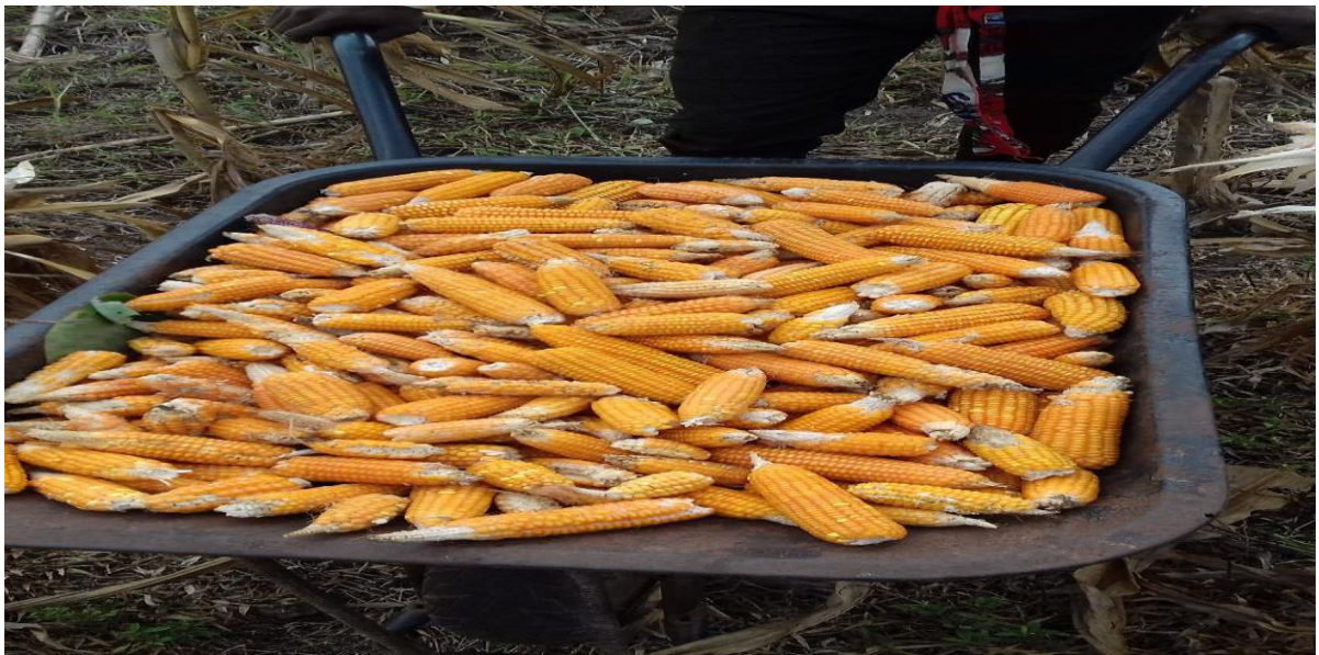
Figure 49: Some of the harvested cobs from the demonstration field