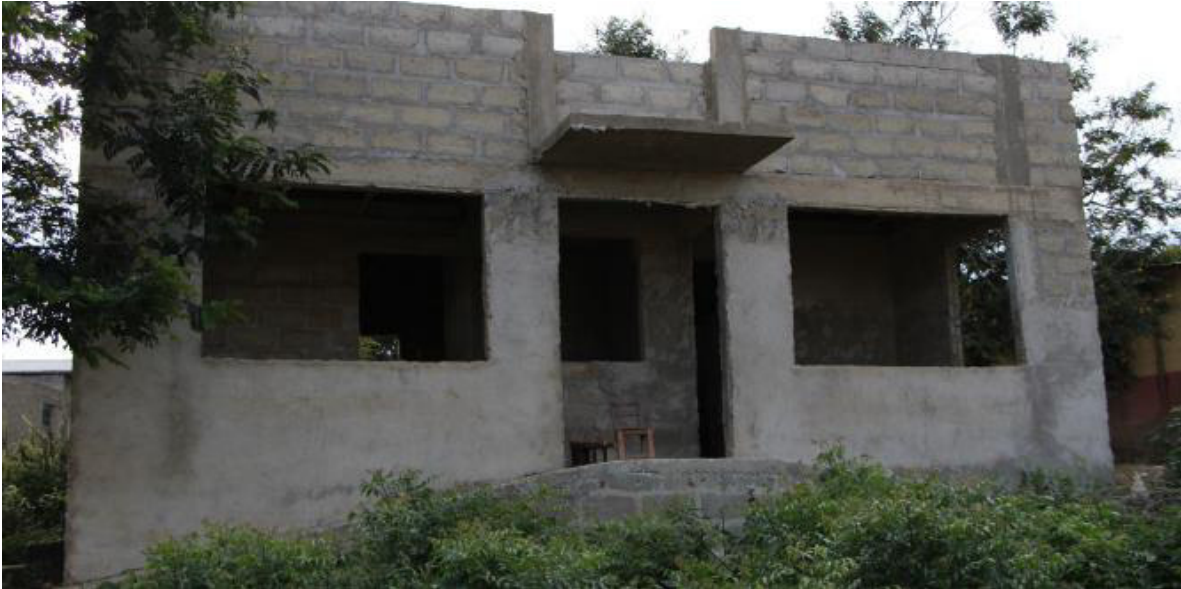
Figure 12: One of the 5no. institutional 10-seater WC toilet at Gomoa Dago