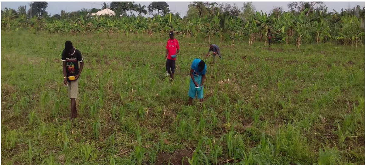
Figure 47: Rasheed Dayman demonstrating fertilizer application during a field day at Ankamu together with some farmers applying them as taught