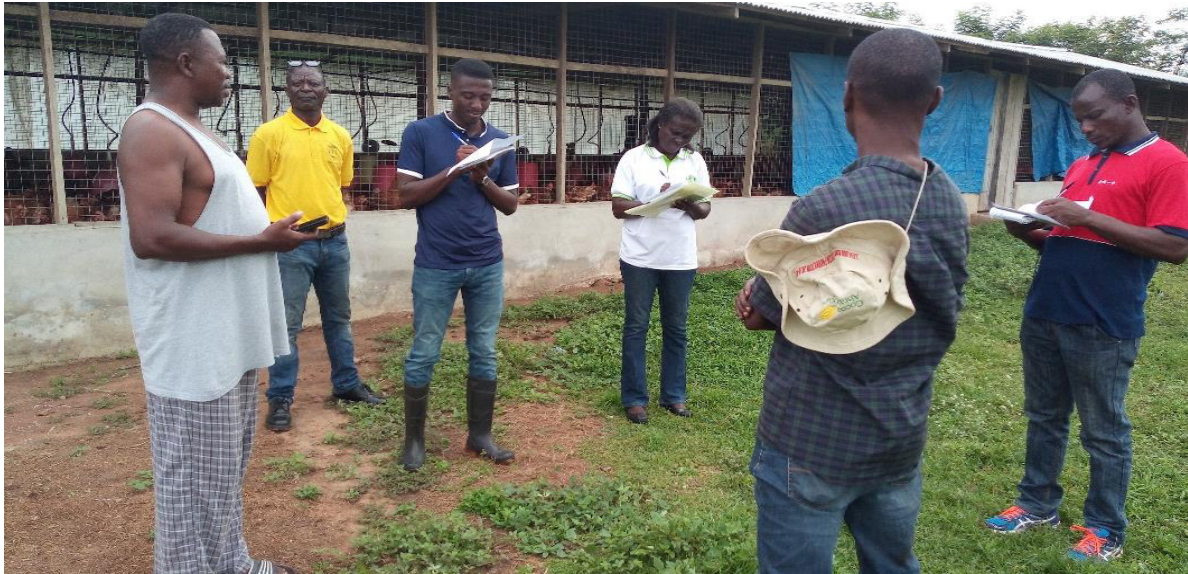
Figure 52: Farmers Day inspection team with one of the nominees