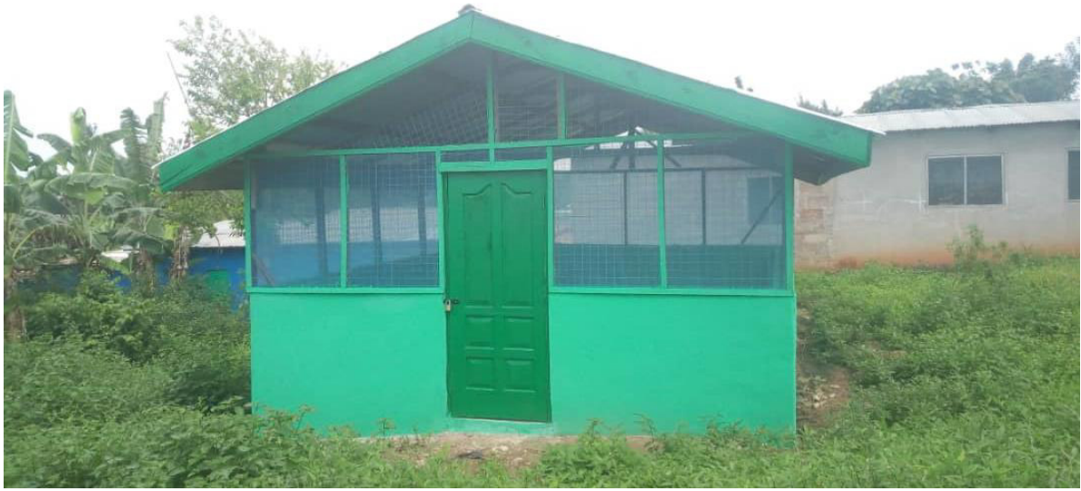
Figure 21: Start up kit Poultry at Gomoa Eshiem