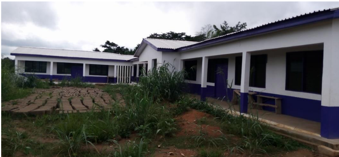
Figure 39: 6-unit classroom block for College of Music, Gomoa Mozano by GNPC