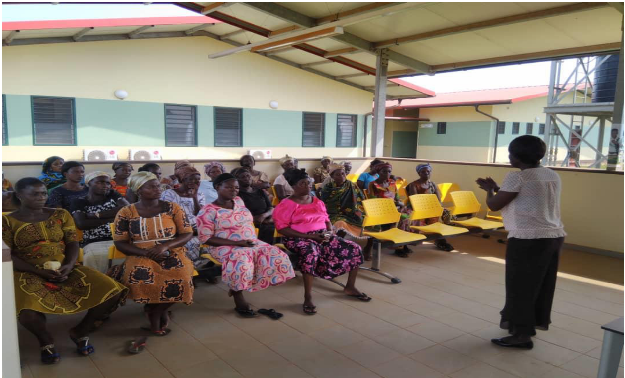
Figure 43: The DDA giving a talk during the programme