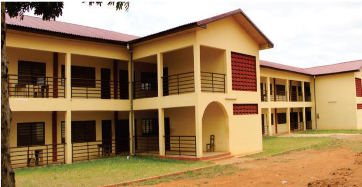
Figure 41: 12-unit classroom block at Gomoa Senior High Technical School, Dawurampong