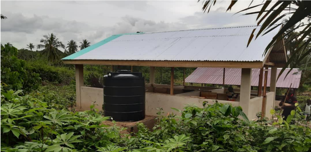
Figure 23: Start up kit for goats and sheep at Gomoa Tarkwa