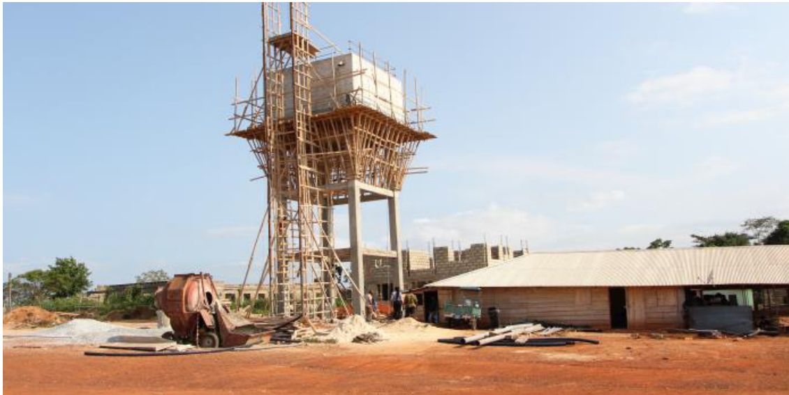
Figure 9: 100 cubic metre overhead tank at Gomoa Ngyiresi