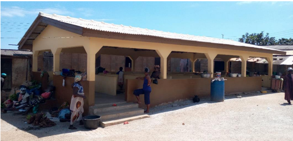
Figure 27: Renovated Gomoa Dago market