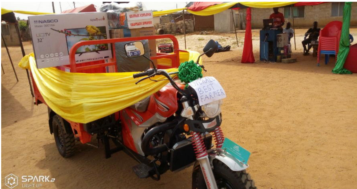
Figure 60: Overall Best Farmer Award