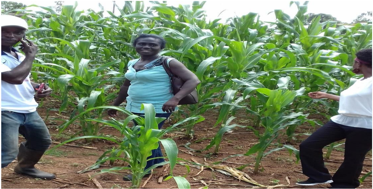
Figure 48: The DDA on the Demonstration field at Ankamu