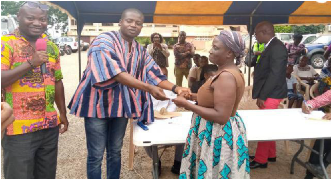
Figure 19: Financial Assistance to PWD