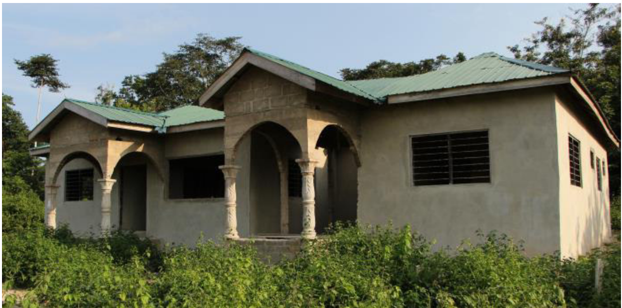
Figure 6: Gomoa Antseadze

Use of Premix Fuel proceed to construct CHPS compounds at