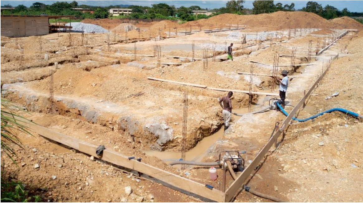
Figure 40: 1no. 2-Storey Dormitory block at Apam Senior High School – foundation level