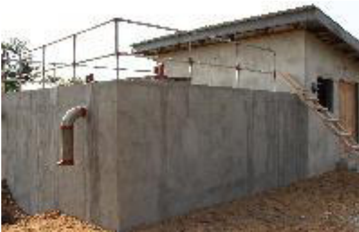
Figure 11: Booster station at Gomoa Brofo