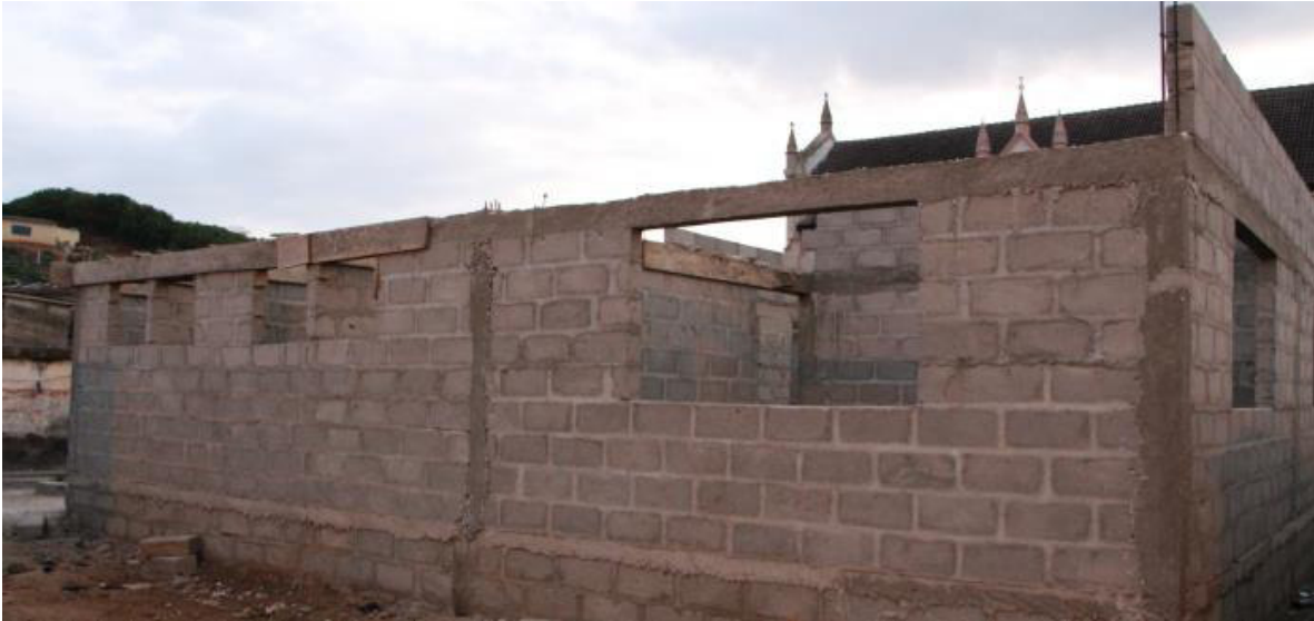
Figure 7: Ino. CHPS Compound at Apam financed with Premix Fuel proceed