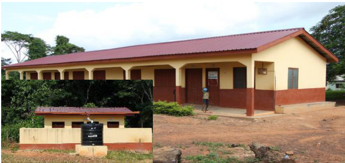
Figure 29: 1no. 3-unit classroom at Gomoa Techiman - completed