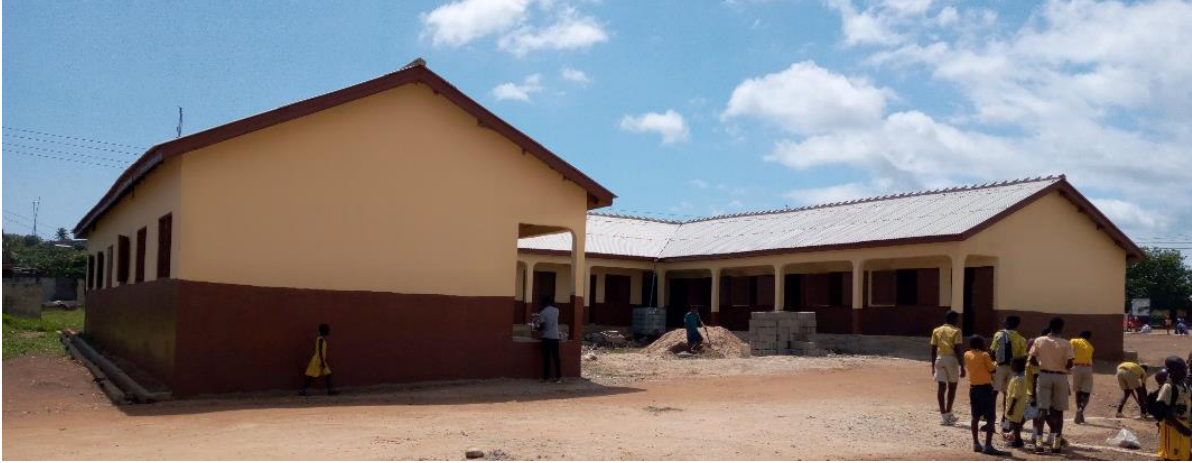
Figure 30: 1no. 6-unit classroom at Mumford – 95%