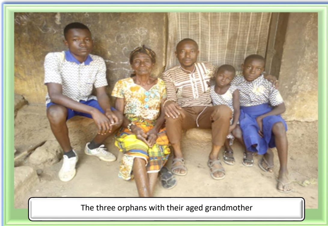
The three orphans with their aged grandmother

Visitation of three (3) orphaned children (2 girls and a boy) who were being cared for by their aged grandmother.