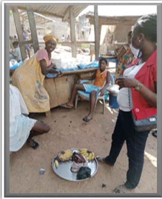
Field officers on Home visits